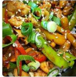
Chicken Stir Fry $14

Fries topped with creamy Mac n Cheese, buttery crab, green onions, yum yum, and bacon bits