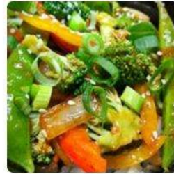
Veggie Stir Fry $12

Our drunken tequila marinated beef with lettuce, salsa, sour cream and cheese