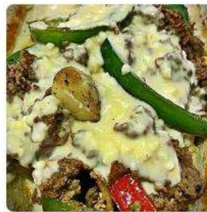
Cheesesteak Fries $17

Marinated and fried beef loaded with lettuce, tomato, cheese, and sour cream.