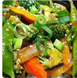
Shrimp Stir Fry $16

Large bed of fries covered with house made cheese sauce, steak, Cajun shrimp, buttery crab, and topped with Parmesan and green onion. 3lbs worth of deliciousness!!!