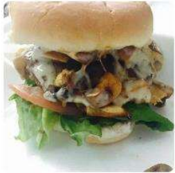
Hamburger with Fries $15

All beef patty on Keiser Roll topped as you like it. Please specify.... Cheddar, Swiss, or Pepper Jack Lettuce, Tomato, Onion, Pickle Mayo, mustard, ketchup, chipotle