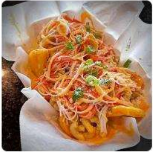
Crabby Mac N Cheese Truffle Fries $15

Fries topped with creamy Mac n Cheese, buttery crab, green onions, yum yum, and bacon bits