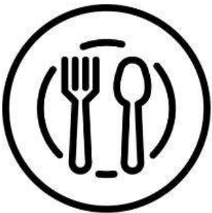
Beef Tacos $14

Grilled and seasoned shrimp in a teriyaki sauce with vegetables and rice. Optional Thai spice available, specify when ordering.