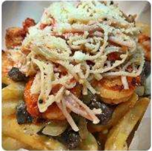
Surf N Turf Fries $18

Tender, seasoned chicken in a teriyaki sauce with vegetables and rice. Optional Thai spice available, specify when ordering. LIMITED SUPPLY DUE TO PRODUCT SHORTAGE