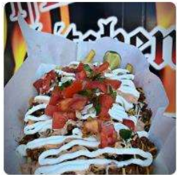
Beef Fries $15

Seasoned beef topped with salsa, sour cream, and house chipotle sauce.