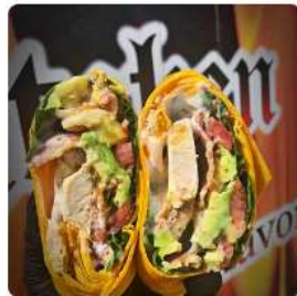
Chicken Bacon Ranch Wrap $10

Our Bacon INFUSED 1/4lb burger with lettuce, tomato, onion, pickle, cheddar cheese, THEN cheesesteak with peppers and onion, topped with provolone, THEN covered with our white cheesesteak cheese, and our house chipotle sauce. The bacon